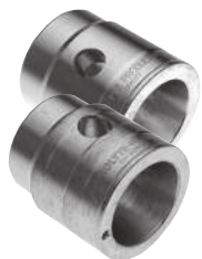
X Coupler - 1 ring

Structural data can be found at www.prolyte.com